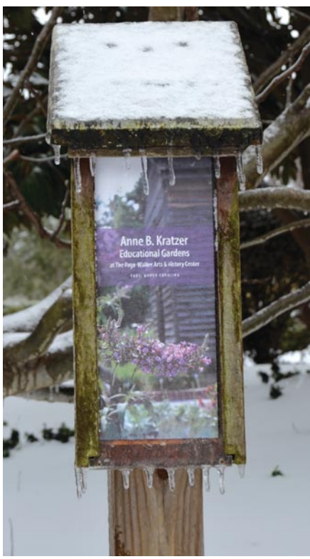
Ready for Spring!