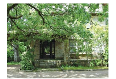
From top: Franklin house; Baucom house; Richard house.