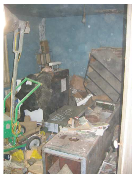
Before (above) and After (below): One of the several rooms in the Waldo House cleaned out by Friends volunteers

In preparation for the presentation to Council and the subsequent move, a small group of Friends have been cleaning up the long-vacant home. On two Saturdays, two 30-cubic-yard waste bins were nearly completely filled with newspapers, magazines, clothes and other trash, including a few large appliances.