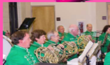
Cary Town Band Concert, Feb. 5