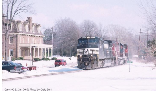
Cary NC 31 Jan 00