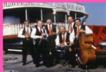
Dukes of Dixieland, Feb. 19